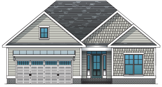
D 1767 SF