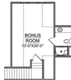
OPT. BONUS W/ 3/4 BATH

Continuous improvment of our plans and community specifications may result in changes without notice. Any dimensional data shown is approximate. Artwork is for illustrative puroposes only. Actual construction details may vary. This plan is property of Bill Clark Homes. Duplication of this plan is prohibited.