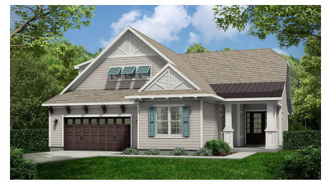
Optional Elevation D4