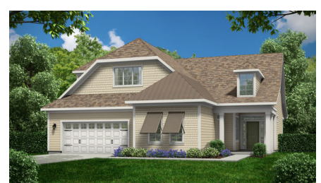
Optional Elevation C3