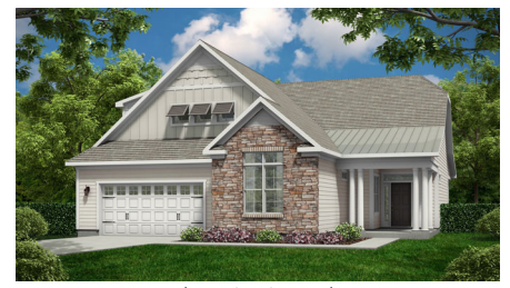
Optional Elevation B2